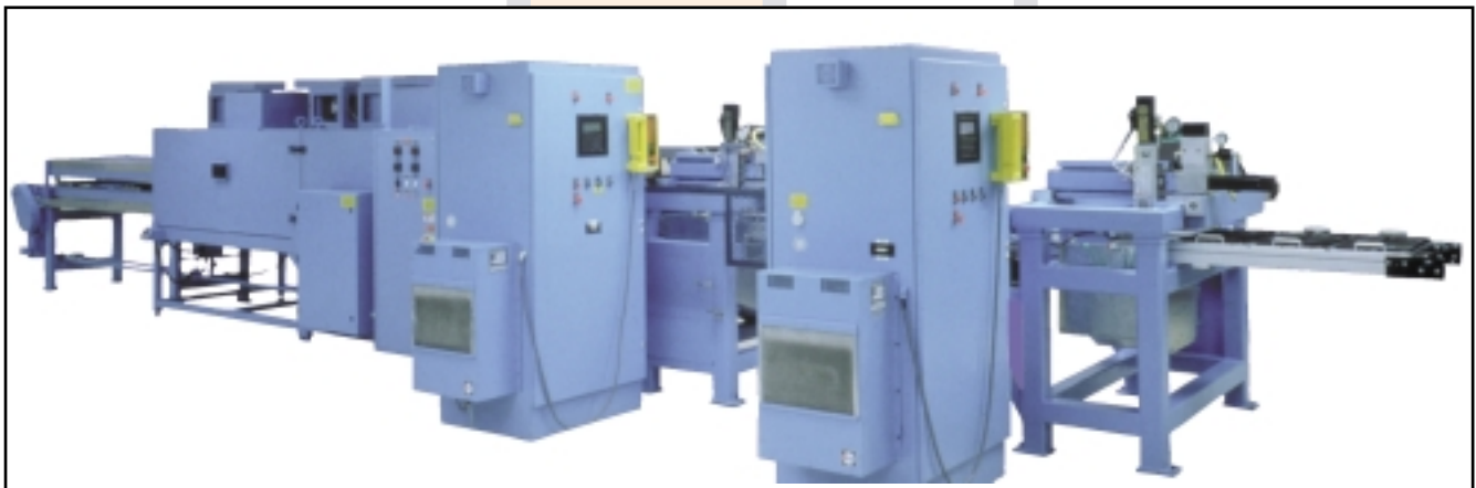
A single gantry "dispense-and-cure" system like this was used to dispense and cure the 2-part LSR bead. The system shown here is a dual Robotics, Inc. GC 1000 gantry variation for another application (gantries center and right). A Robotics, Inc. conveyORIZED CNV oven cures and cools the parts (left).

Robotics, Inc. contract gasketing services are ideal when high precision and bead consistency are required, but production volume doesn't warrant a dispensing equipment purchase. A wide variety of applications are possible. A few of the endless examples include electronic assembly, connector potting, motor gasketing, headlamp sealing, steam iron gasketing, appliance component gasketing, medical instrument sealing and potting, glass sealing, etc.